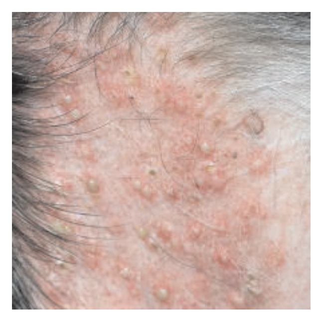
Figure 4. Pustular demodicosis on the ventrum of a dog with generalized demodicosis. [Colour figure can be viewed at wileyonlinelibra ry.com]

Demodex gatoi is a contagious mite that inhabits the stratum corneum (like Sarcoptes) and the most common clinical feature is pruritus ranging from mild to very