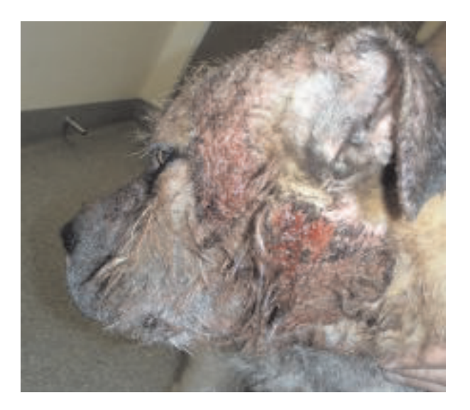
Figure 5. Severe facial demodicosis in a dog. [Colour figure can be viewed at wilevonlinelibrary.com]

Deep skin scrapings are considered to be the diagnostic tool of choice in most patients with suspected demodicosis.<sup>78</sup> Samples may be collected with curettes, spatulae, sharp or dull scalpel blades. Placing a drop of mineral oil on the sampling instrument or directly on the skin is helpful for better adherence of the sampled debris to the instrument. Multiple scrapings of approximately 1 cm<sup>2</sup> of affected skin should be performed in the direction of the hair growth and importantly the skin should be squeezed constantly or intermittently during scraping to extrude the mites from the depth of the follicles to the surface. Squeezing the skin has been shown to increase the number of mites found.<sup>79</sup> Primary lesions such as follicular papules and pustules should be selected in order to obtain the best yield. If at early onset papules and pustules are not present, erythematous, alopecic areas should be chosen. Ulcerated areas are not suitable as it is