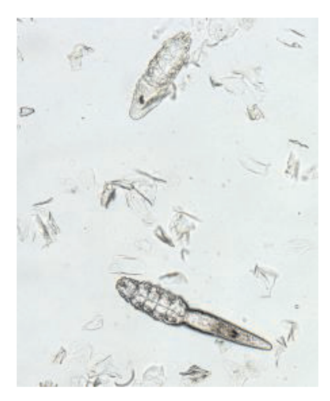
Figure 9. Demodex canis mites in a skin scraping (×100). [Colour figure can be viewed at wileyonlinelibrary.com]

less likely to find parasites in such areas. The skin is scraped until capillary bleeding occurs indicating sufficient depth of the scraping. The gathered debris should be of reddish to brownish colour, indicating sufficient material (Figure 8). If necessary in a long- or medium-haired dog, lightly clipping the area to be scraped (in the direction of hair growth) will minimize the loss of the scraped material into the surrounding hair. Debris then is transferred to a