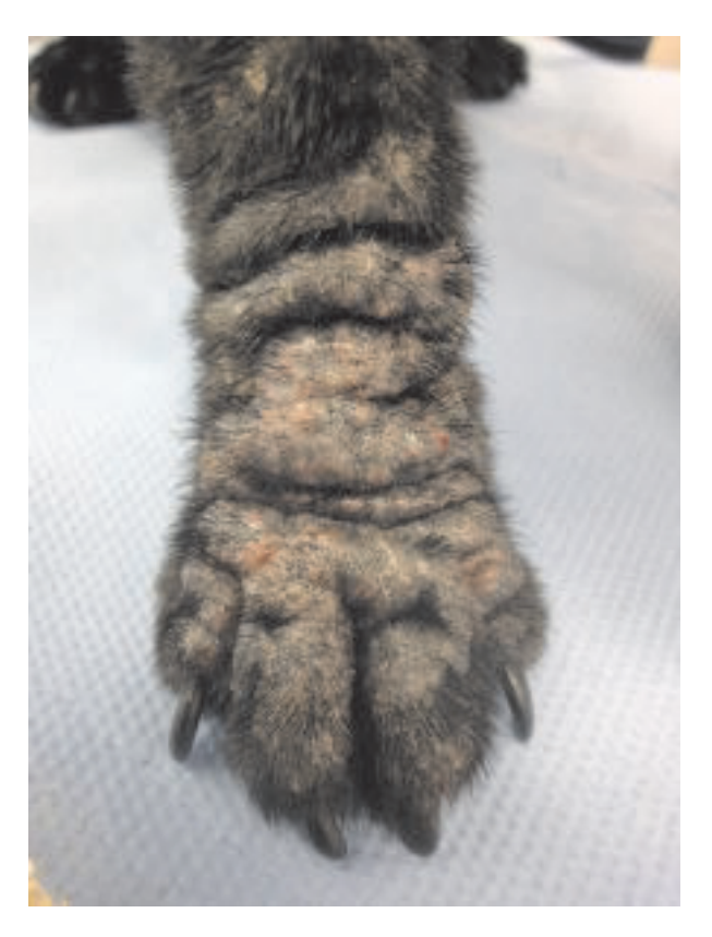
Figure 3. Pododemodicosis in a 1-year-old, male neutered pug with generalized demodicosis. [Colour figure can be viewed at wileyonline library.com]

of the body. Follicular plugging, dilation and hyperpigmentation of hair follicular ostia may be present and when seen are a clinical clue for the disease. Pedal demodicosis commonly causes quite marked hyperpigmentation (of both follicles and surrounding skin) and may present with significant interdigital inflammation, oedema and pain (Figure 3). In more inflammatory presentations, follicular-oriented papules may develop. Pruritus is generally not thought to be characteristic of milder presentations; however, it is more common if the short-bodied morphological variant of D. canis <sup>61,62</sup> is present and/or if secondary