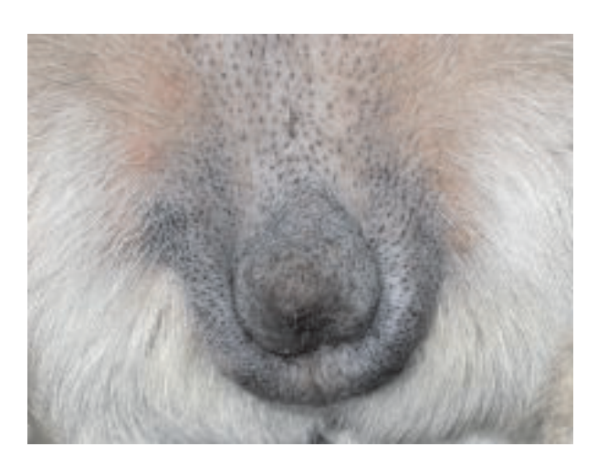
Figure 1. Comedones in the perivulval area of a dog with demodicosis. [Colour figure can be viewed at wilevonlinelibrary.com]

Clinical signs develop after mite proliferation has occurred; they depend on the degree of mite proliferation. Initially, there may be a noninflammatory hypotrichosis/ alopecia and/or an inflammatory dermatitis with mild erythema, comedone formation, scaling and associated hypotrichosis/ alopecia (Figures 1 and 2). The lesions may be focal or multifocal to coalescing involving large areas