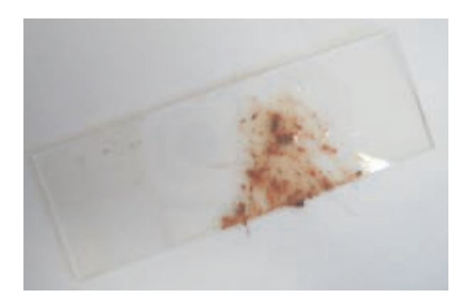
Figure 8. Debris gathered with a deep skin scraping. [Colour figure can be viewed at wileyonlinelibrary.com]

less likely to find parasites in such areas. The skin is scraped until capillary bleeding occurs indicating sufficient depth of the scraping. The gathered debris should be of reddish to brownish colour, indicating sufficient material (Figure 8). If necessary in a long- or medium-haired dog, lightly clipping the area to be scraped (in the direction of hair growth) will minimize the loss of the scraped material into the surrounding hair. Debris then is transferred to a