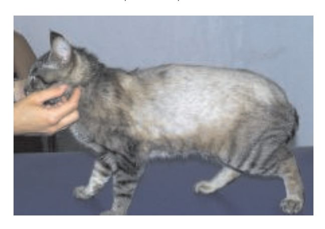
Figure 7. Alopecia due to Demodex gatoi in a DSH. [Colour figure can be viewed at wileyonlinelibrary.com]