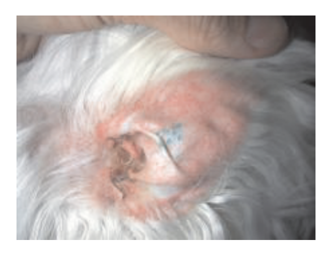
Figure 2. Erythematous and scaly pinna of a dog with demodicosis. [Colour figure can be viewed at wileyonlinelibrary.com]

of the body. Follicular plugging, dilation and hyperpigmentation of hair follicular ostia may be present and when seen are a clinical clue for the disease. Pedal demodicosis commonly causes quite marked hyperpigmentation (of both follicles and surrounding skin) and may present with significant interdigital inflammation, oedema and pain (Figure 3). In more inflammatory presentations, follicular-oriented papules may develop. Pruritus is generally not thought to be characteristic of milder presentations; however, it is more common if the short-bodied morphological variant of D. canis <sup>61,62</sup> is present and/or if secondary